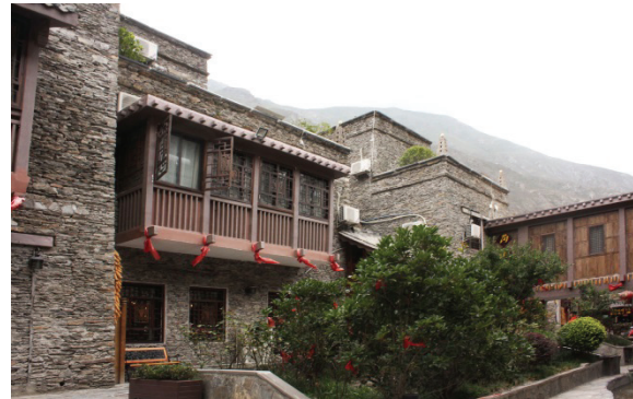
Figure 4. General plan of the Tonghua old village

Tibetan settlements in Lixian County rely on cultivated land. They are usually built in the edge of the farmland, without the occupation of the ripening soil. The settlements are in sunny base near springs, streams or rivers. Similar to the Qiang houses, the Tibetan houses in Lixian County are also called "towers". Most of them use the wall to bear the structure system. The 1st floor is for the livestock, 2nd and 3rd floor is for living and praying, and the top floor is roof terrace.