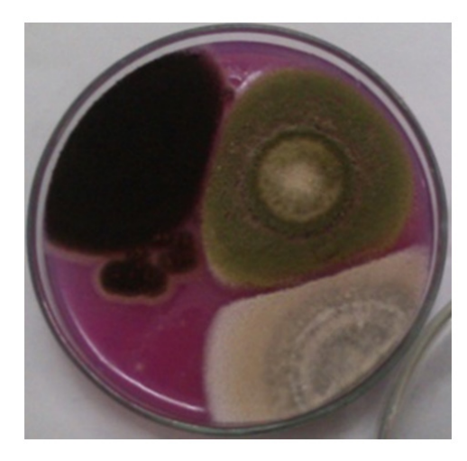
Figure 2. Fungal colonies on Rose Bengal Agar medium